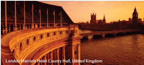
London Marriott Hotel County Hall, United Kingdom

From leisure to business to pure luxury, whatever people are travelling for, wherever in the world they go, with the Marriott Group they're always at home.