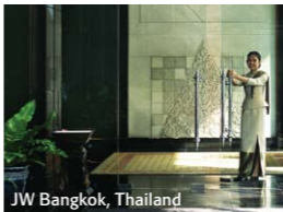
JW Bangkok, Thailand