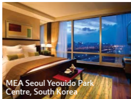
MEA Seoul Yeouido Park Centre, South Korea