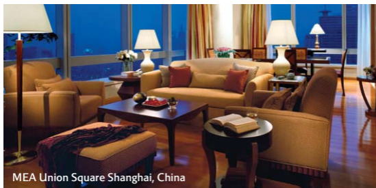
MEA Union Square Shanghai, China