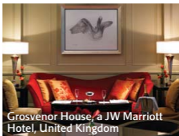
Grosvenor House, a JW Marriott Hotel, United Kingdom