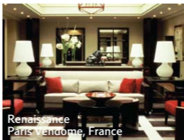
Renaissance Paris Vendôme, France