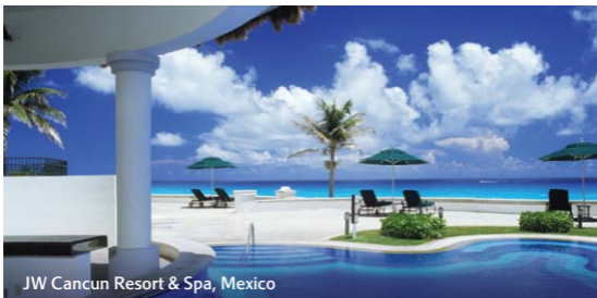
JW Cancun Resort & Spa, Mexico