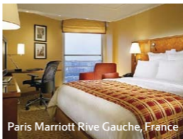
Paris Marriott Rive Gauche, France