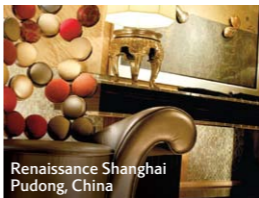
Renaissance Shanghai Pudong, China