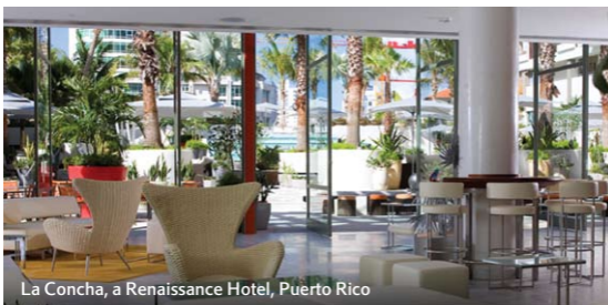
La Concha, a Renaissance Hotel, Puerto Rico